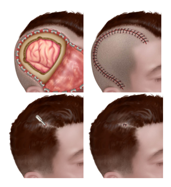
Figure 2 Top row: Open craniotomy - intraoperative and postoperative Bottom row: Minimally invasive laser ablation - intraoperative and postoperative